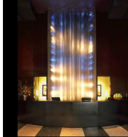
18. Waterfall Waterfall Stainless steel bead 24' tall, 6' wide, 1' deep $12,000 Several miles of beaded chain with moving lights and air simulating a dry waterfall