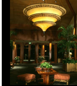
17. Hand Painted Silk Art Hand Painted Silk Art Four Seasons, Hawaii 9' tall by 11' diameter 1995