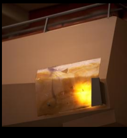
15. Benaroya Hall Glass and aluminum Seattle, WA Several 24"x24"x24" lights $250,000 1998