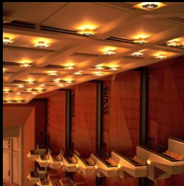
13. Benaroya Hall Glass and aluminum Seattle, WA Several 24"x24"x24" lights $250,000 1998