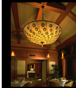
16. Hand Painted Silk Art Hand Painted Silk Art Four Seasons, Hawaii 9' tall by 11' diameter 1995