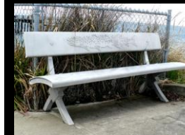
20. Community Benches 25 benches, formed and welded aluminum with individual artwork For City of Port Angeles 30"h x 72" w x 24"d $37,500 2007