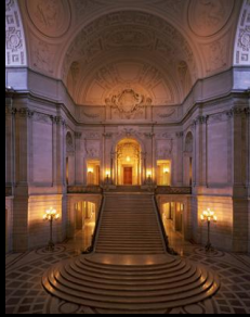
12. San Francisco City Hall Bronze and glass San Francisco, CA $1.5 million 1998