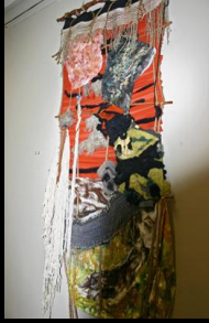
11. Boudoir Painted & Woven Fabrics Petaluma, CA 10' tall $9,000 private funds 2007

118 ½ E Front St. Port Angeles, WA 98362 415-990-0457 sculptorbobstokes@yahoo.com