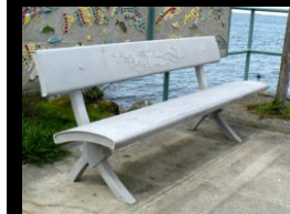
19. Community Benches 25 benches, formed and welded aluminum with individual artwork For City of Port Angeles 30"h x 72" w x 24"d $37,500 2007